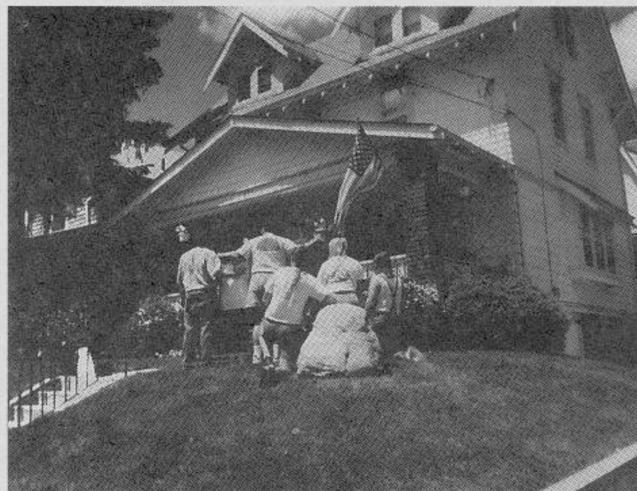
Remaining Anonymous in front of Dr. Bob's House.

In May of this year, I had the opportunity to attend the 1994 C.A. World Service Convention in Cleveland Ohio. When I registered for the convention, I signed up for the excursion to Dr. Bob's house arranged by the committee. When I arrived in Cleveland, and obtained a convention schedule, I found the trip had been planned for Saturday. I was in a predicament. Selfishly, I didn't want to miss any of the workshops held that day. You know, the important ones . . . Sex in Sobriety, Relationships, etc. Being an addict, I